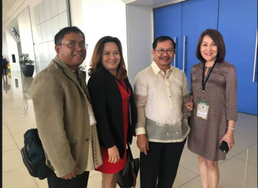
More than 50 top-notch global speakers, the ASEAN Mentorship for Entrepreneurs Network (AMEN), ASEAN Business Advisory Council (ASEAN BAC) Philippines, together with Go Negosyo and the Department of Agriculture (DA) Philippines, held the most anticipated and biggest ASEAN Agriculture Summit on October 1, 2018, at SMX Convention Center Manila, Pasay City. With the theme "Champions and Emerging Icons of Inclusive Business, Technology and Innovation in Agriculture," the summit showcase how agriculture is a game changer by bringing together various stakeholders of the diverse agriculture ecosystem who presented the ongoing developments in agriculture enterprises with inclusive business and 3Ms initiatives (Mentorship, Money and Market) as a way to share real live learnings.