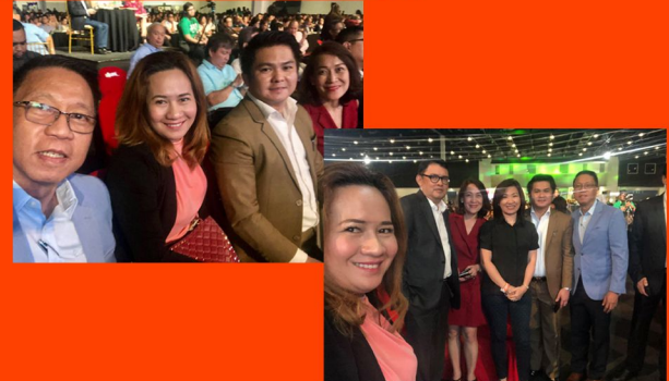
Go Negosyo and the ASEAN Business Advisory Council Philippines, in partnership with the Department of Tourism and Tourism Promotions Board, supported by the business chambers and organizations, successfully hosted the first Tourism Summit 2019 that happened May 2, 2019, at the World Trade Center, Pasay City! Participated by more than 10,000 delegates composed of students from 100 schools and universities, government representatives from around 100 cities and municipalities, ambassadors and members of the diplomatic corps, more than 50 local and international speakers, government and private partners, and entrepreneurs.