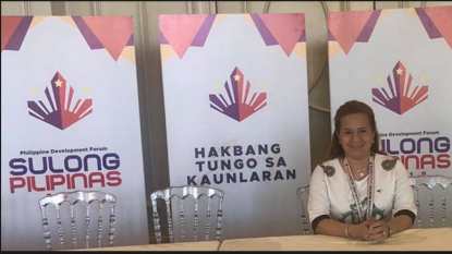
'Sulong Pilipinas,' the annual consultative forum held by the Duterte administration with the private sector, will focus on tax reform and the 'Build, Build, Build' infrastructure program this year. The previous 'Sulong' forums were held once each year since 2016 to gather the inputs and recommendations of the business sector on how the government could further improve the country's investment climate and fulfill President Duterte's agenda of high-and inclusive-growth.